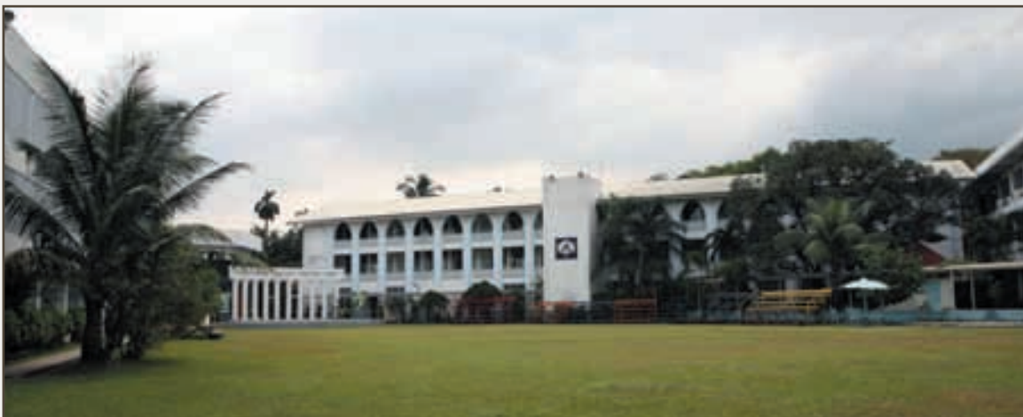
La Consolacion College - Manila

Now, I am very excited for this year's winter season in Korea, it will be my first time to experience a winter with snow on the ground. In the Philippines, we only have two seasons-sunny and rainy seasons (unlike Korea which has four seasons). I will be celebrating my 21st birthday here in Korea. Even though I am sad because my family will not be here, I am also excited to celebrate it here in Korea.