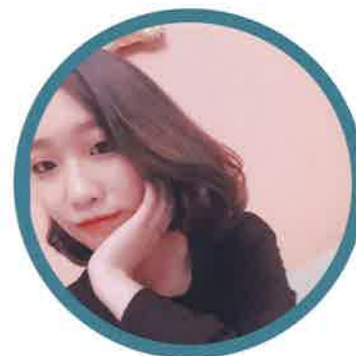
By O, Yu-jeong